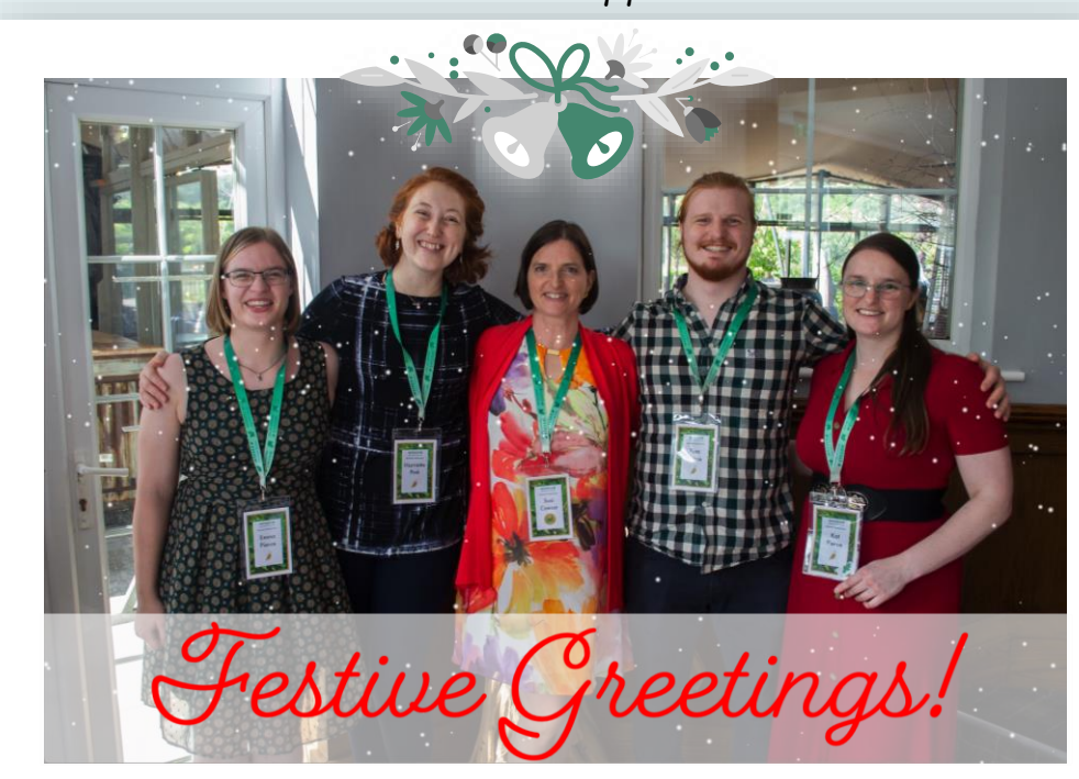
From the Wessex Appraisal Team

All that's left at the end of this newsletter is to wish everyone a joyful festive season and to have a very happy New Year! Please remember to take some proper rest and recuperation to look after yourselves. We look forward to reconnecting with you all soon!